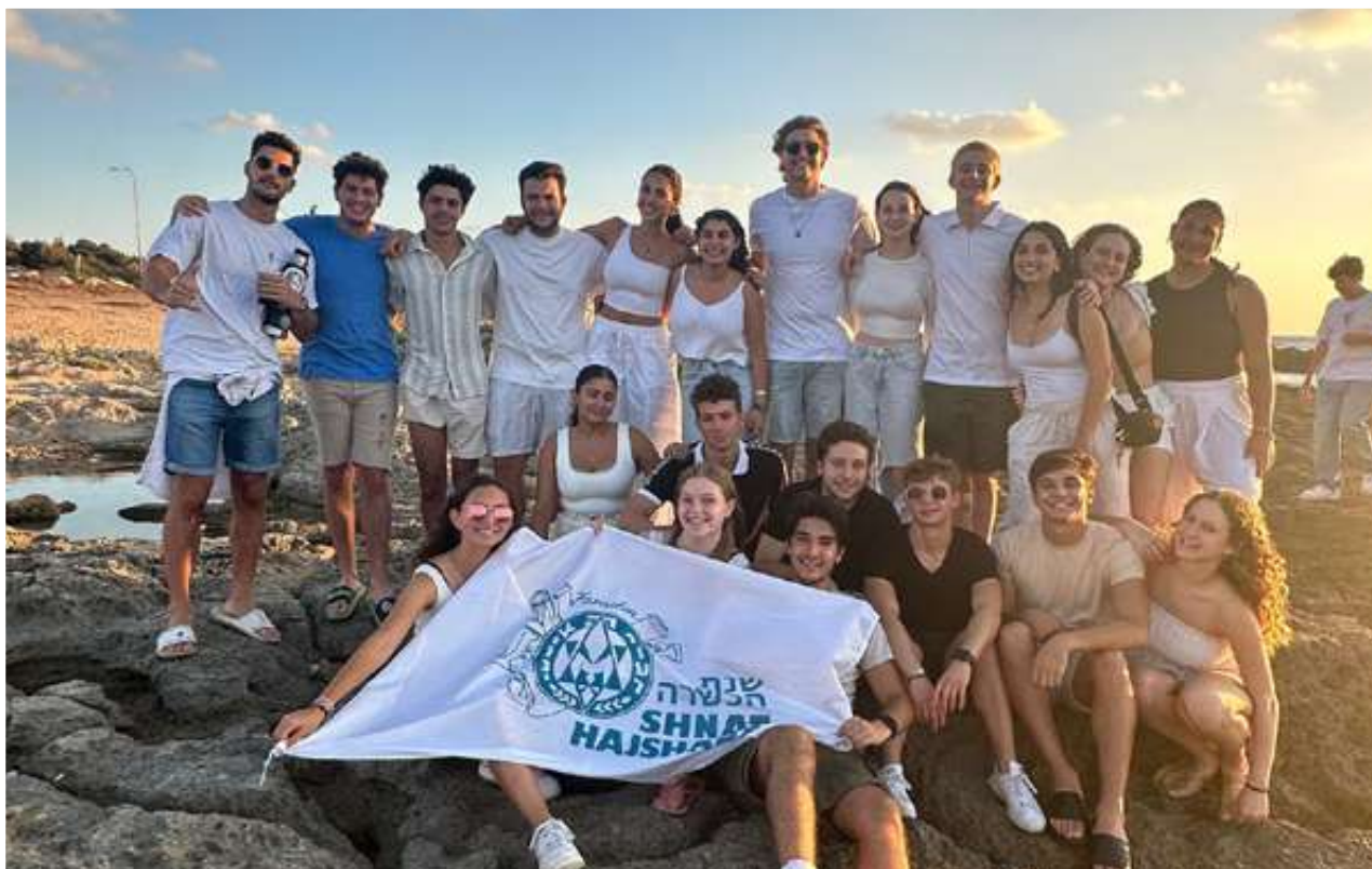
Shnat Hachshara Tzafon in the MIC 3, 2023.