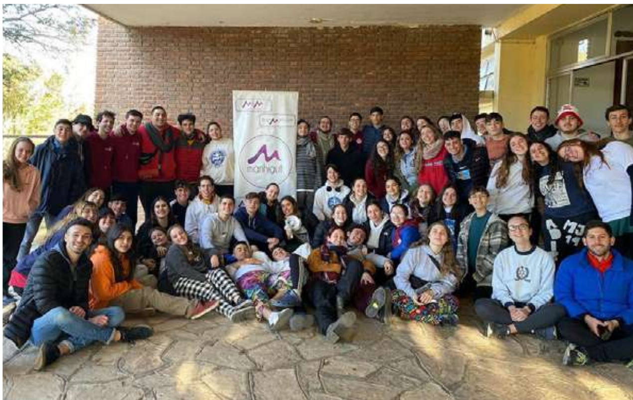
Manhigut Argentina, 2023.