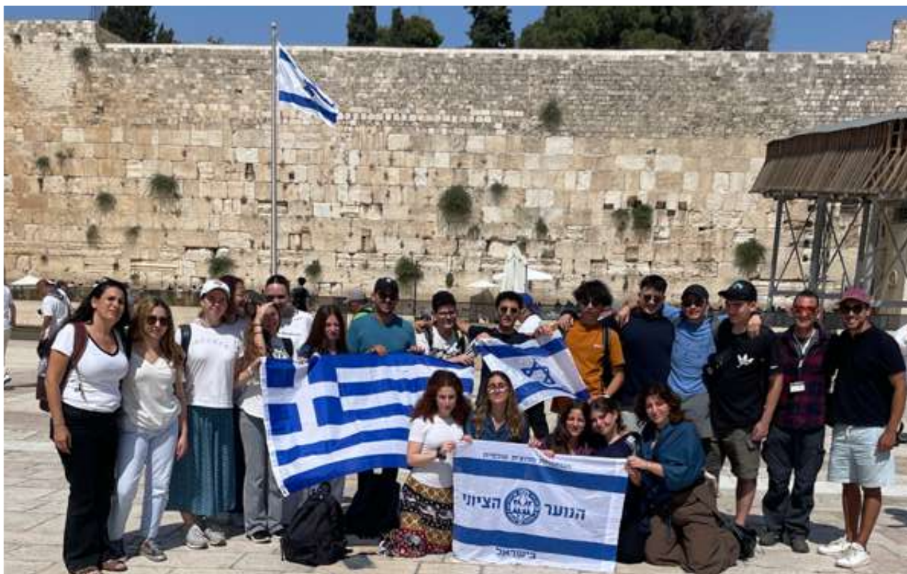
Trip to Israel Greece Community, 2023.