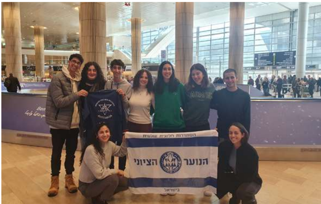
Shnat Hachshara Hineni, 2023.