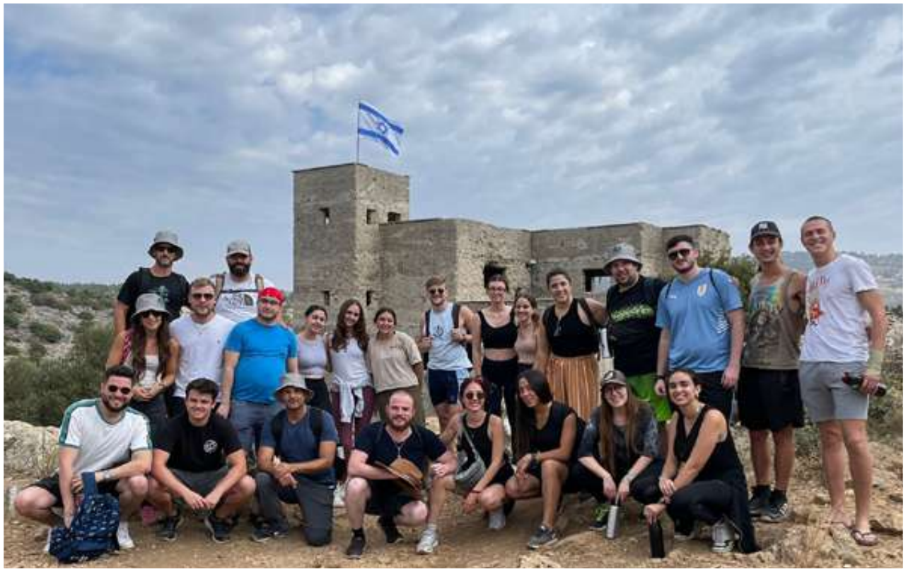
Bama Olim B'Israel and Manhigut at the MIC 2, 2022.