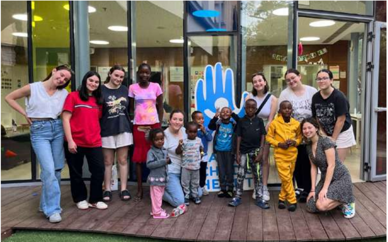
Arevim Masa Year of Service 2022-2023 at "Save a Child's Heart" association.