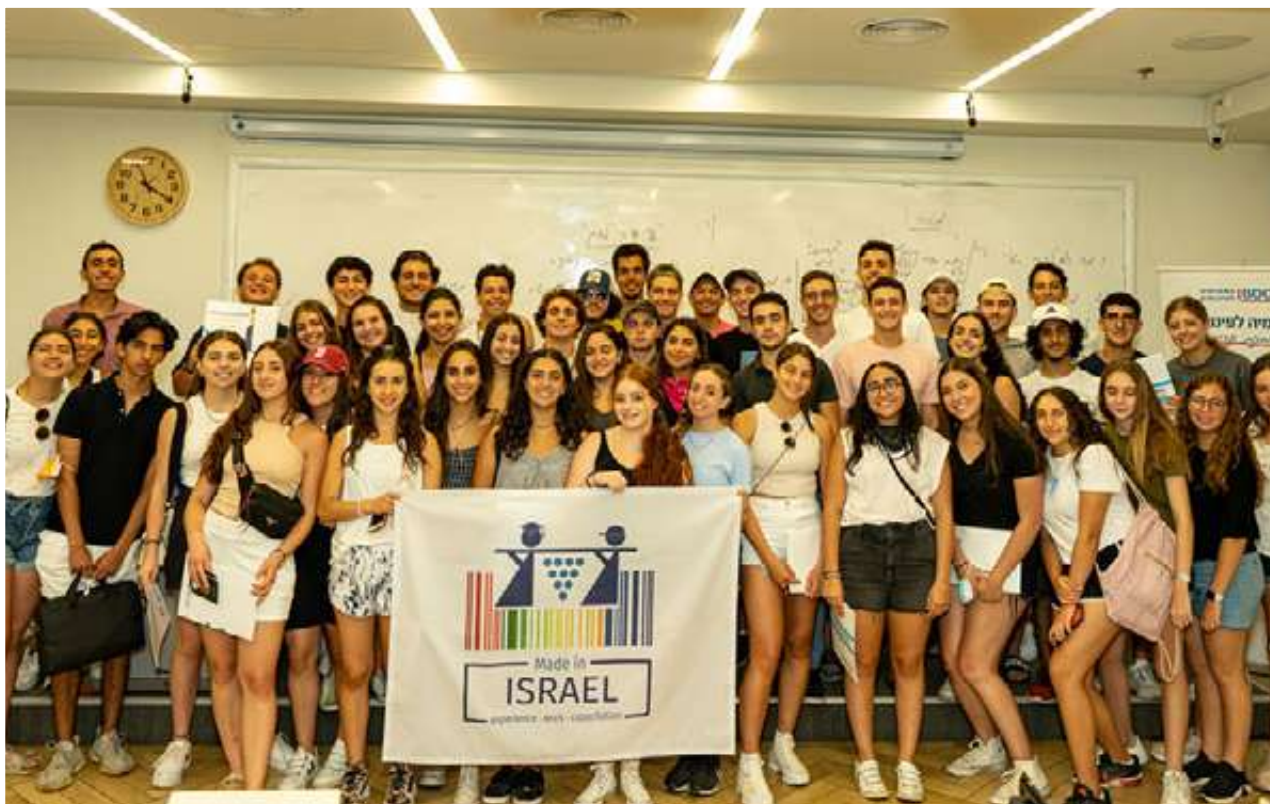
Made in Israel, 2021.