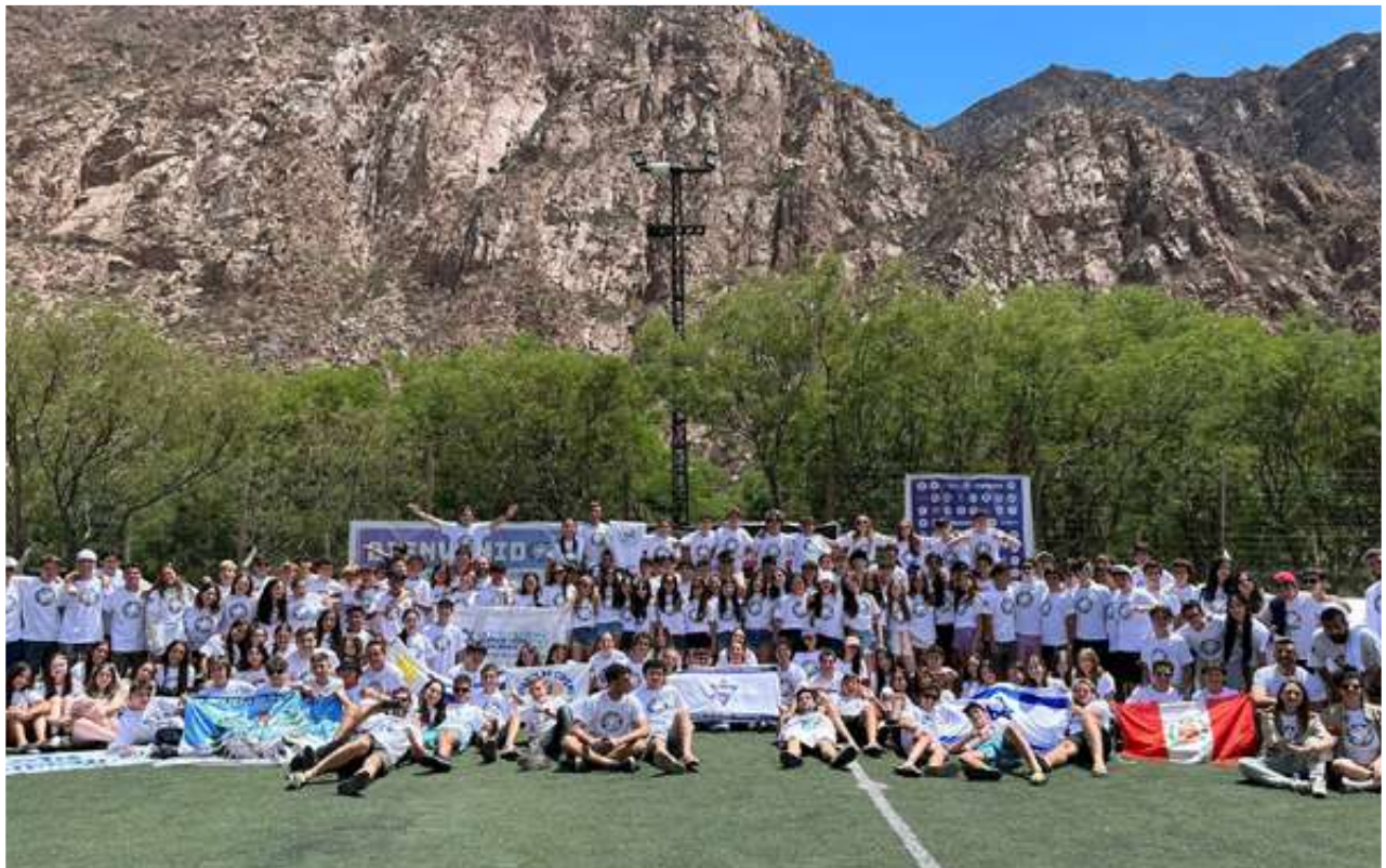
MCD 70, Argentina, 2023.