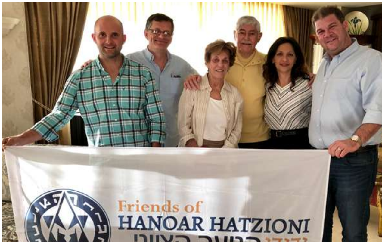
Board of Directors meeting of Friends of Hanoar Hatzioni- Geffen's Family House, Houston