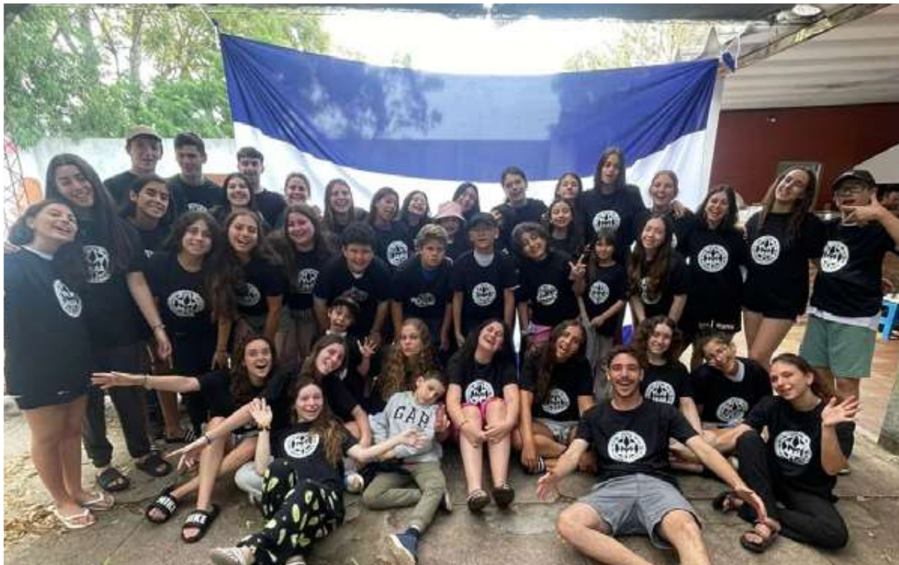
Hanoar Hatzioni B'Uruguay, 2023.