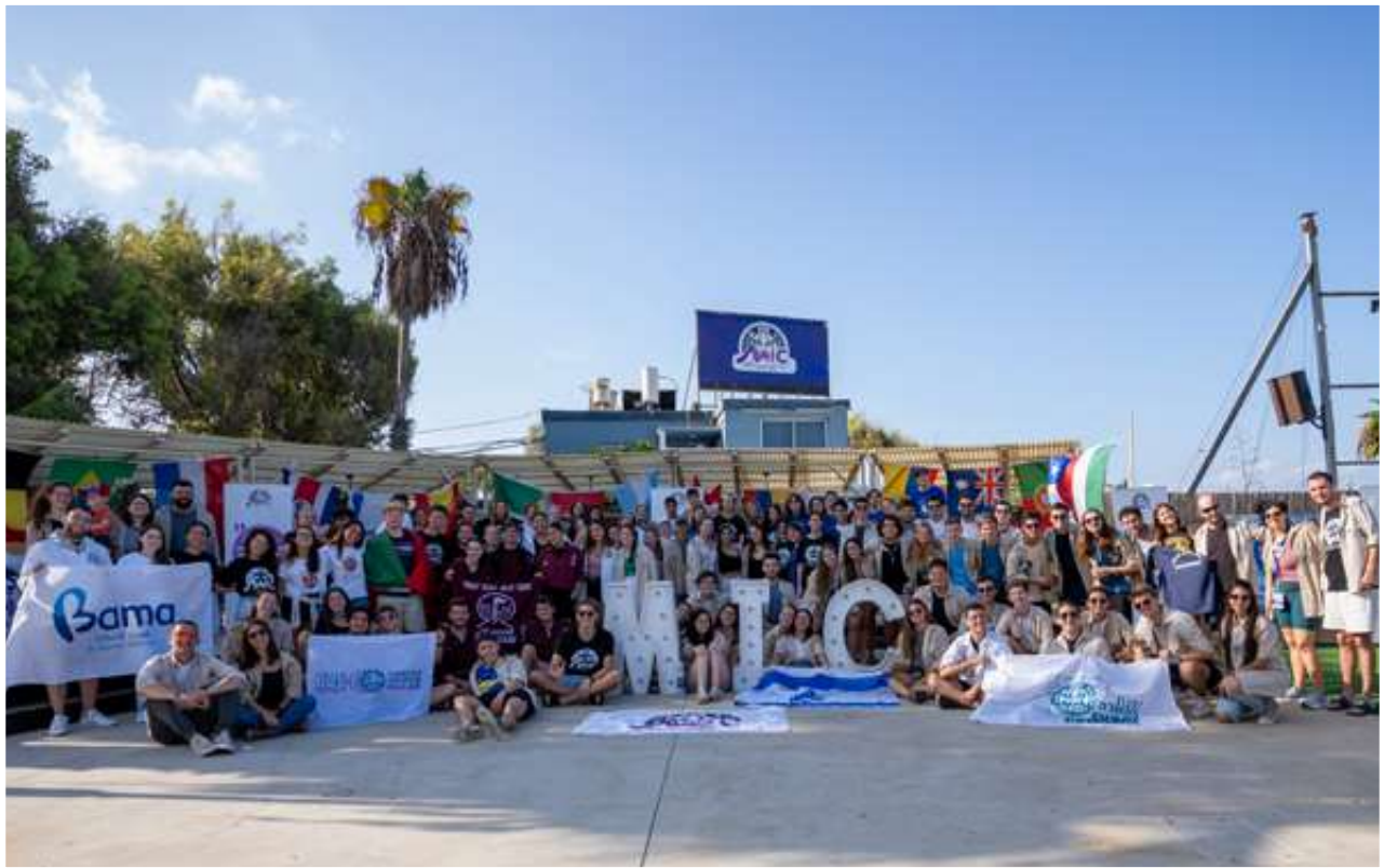
MIC 3 (Manhigut International Camp), 2024.