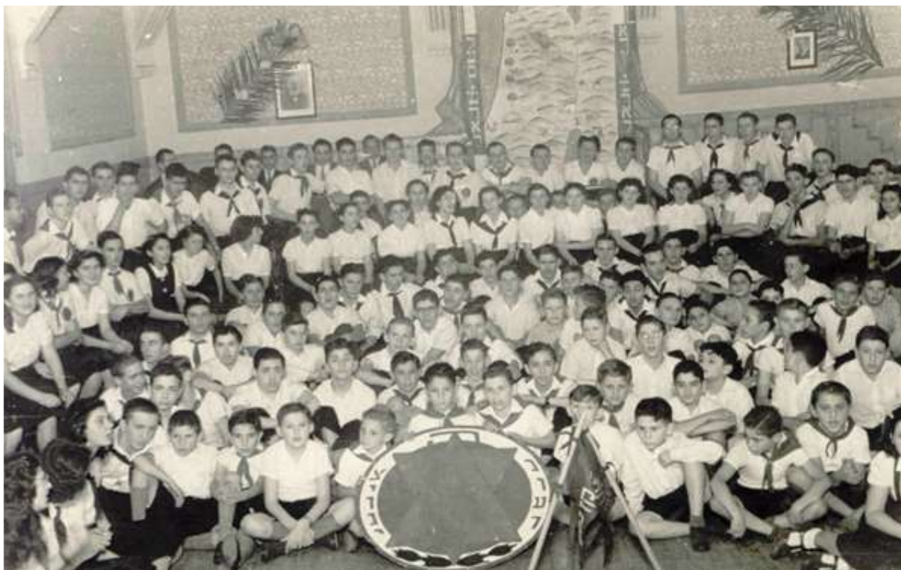
Consequently in 1925.