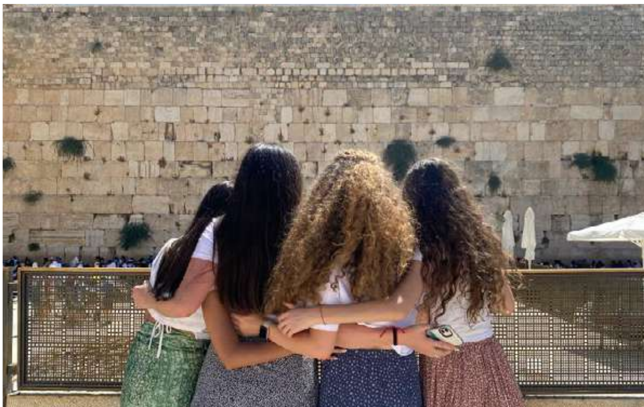
School Trip 2022.