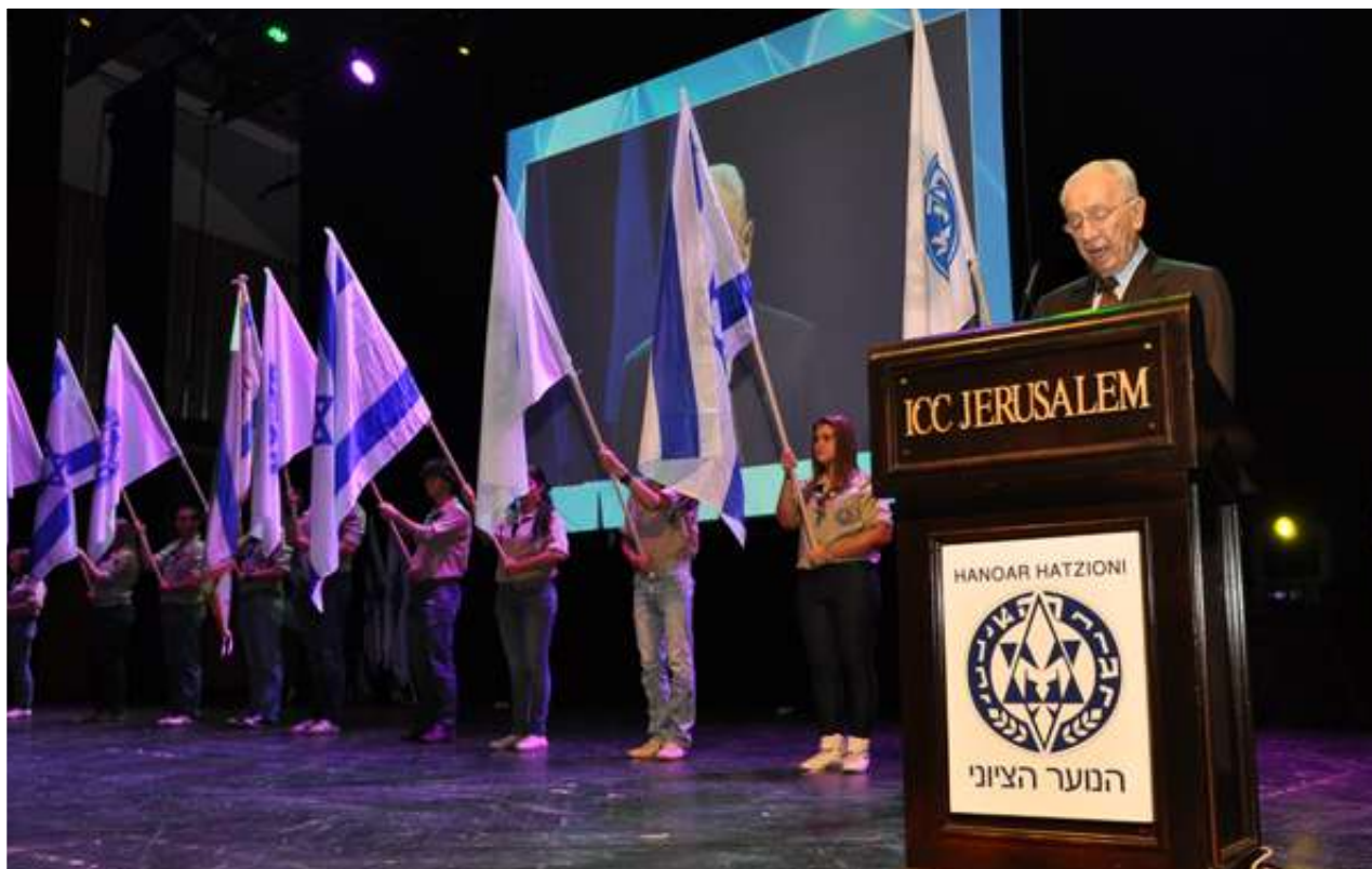
Shimon Peres's (Z"l) Speech 85th Anniversary of Hanoar Hatzioni World Movement