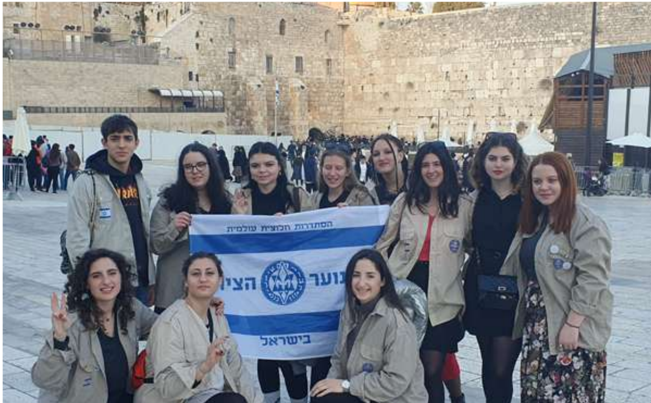
ISM (Intensive Seminar for Madrichim/ot), Tzevet of Hungary in Israel 2023.