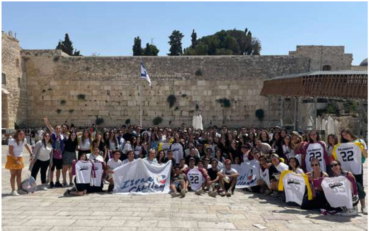
Israel Challenge, 2022.