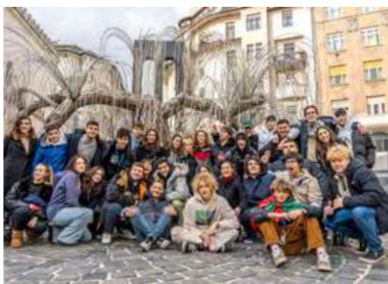
SBM Budapest, February 2023