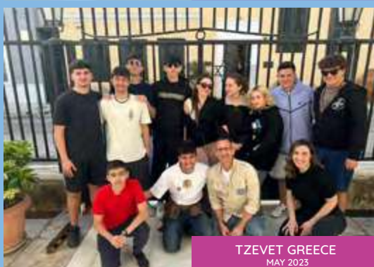
TZVET GREECE MAY 2023