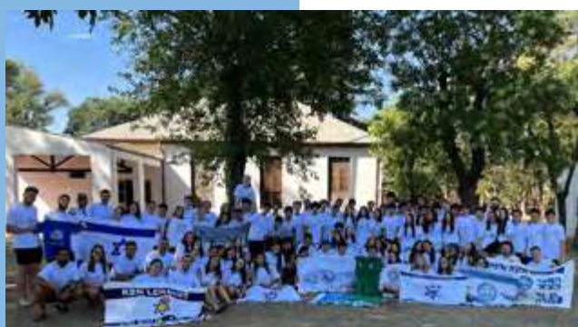
CONTINENTAL MACHON DROMI '69 JANUARY 2023

Hanoar Hatzioni, Tzeirei Ami, Centro Juventud Sionista, Israel Hatzeira, Olam Beiajad, Netzah Israel and Dor Jadash.