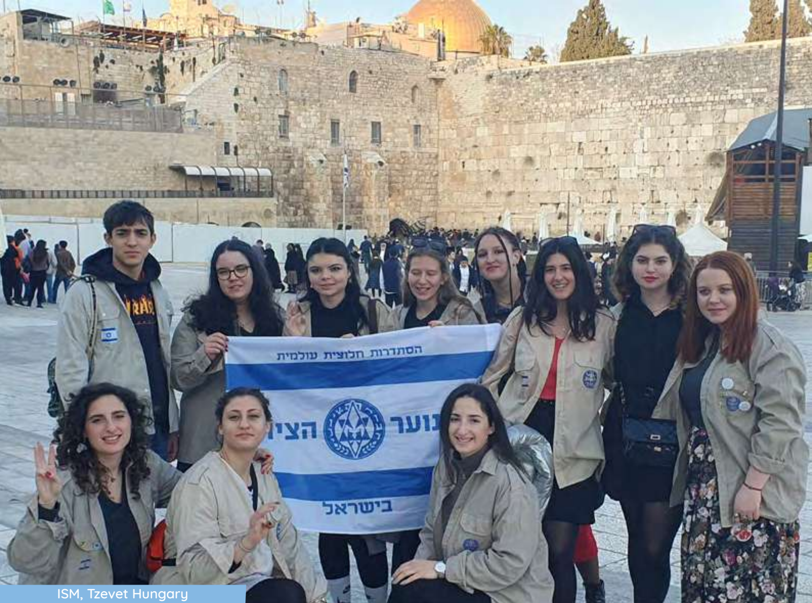
ISM, Tzevet Hungary