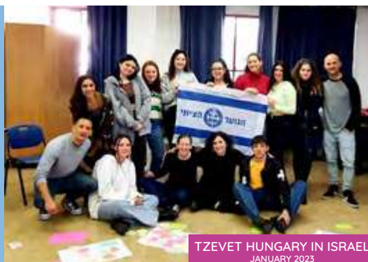
TZVET HUNGARY IN ISRAEL JANUARY 2023

Were trained under this framework that fosters analysis through educational tools.