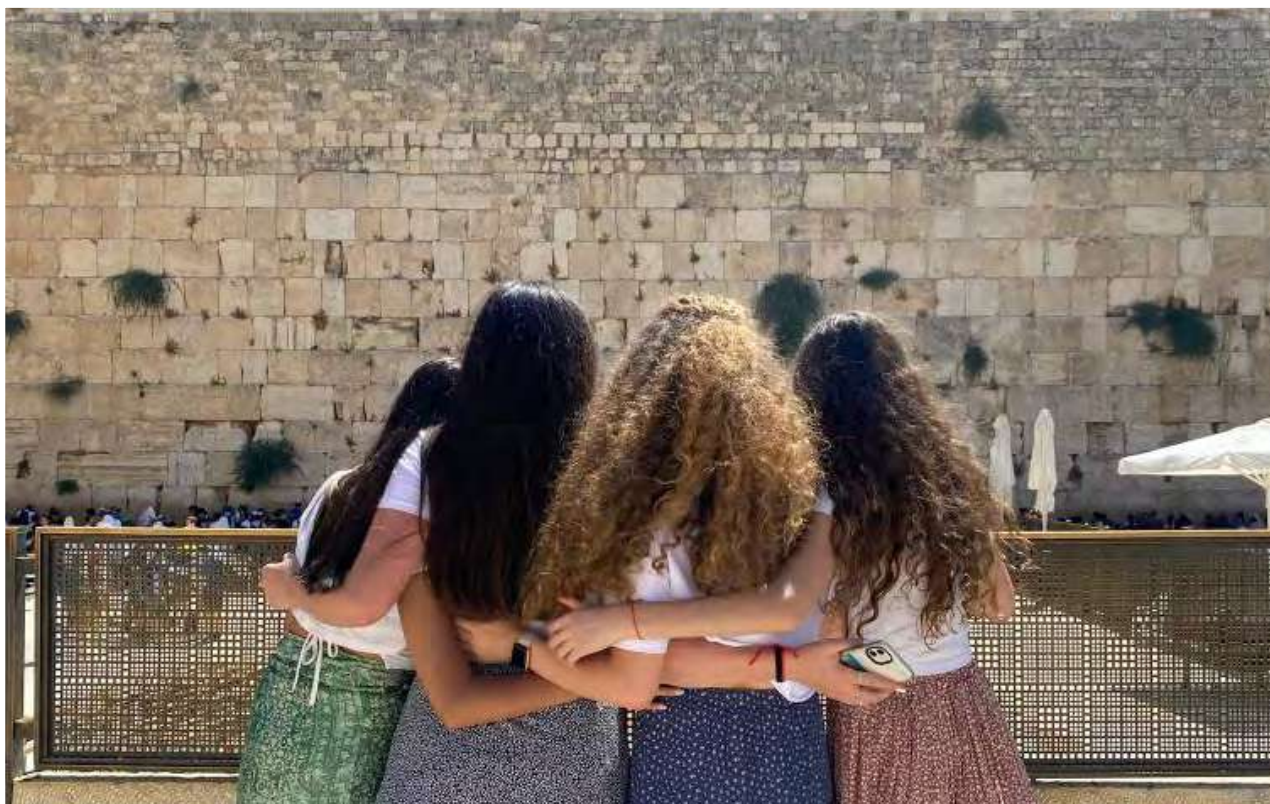
School Trip 2022.