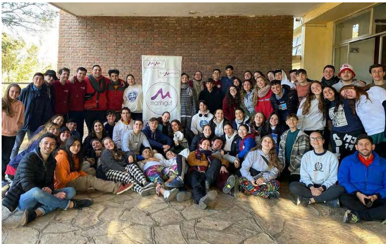
Manhigut Argentina, 2023.