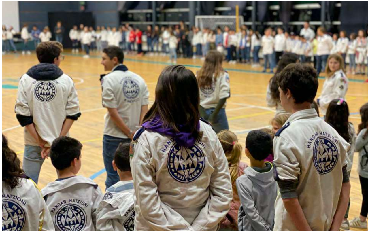
HH B´México, Tarbut School, 2019.