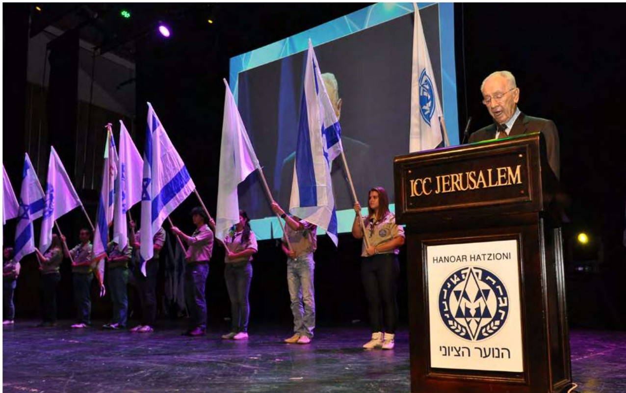
Shimon Peres's (Z"l) Speech 85th Anniversary of Hanoar Hatzioni World Movement