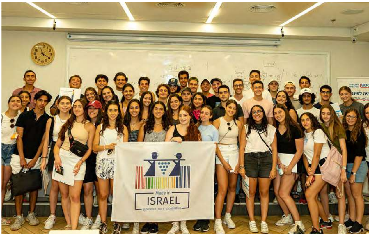
Made in Israel, 2021.