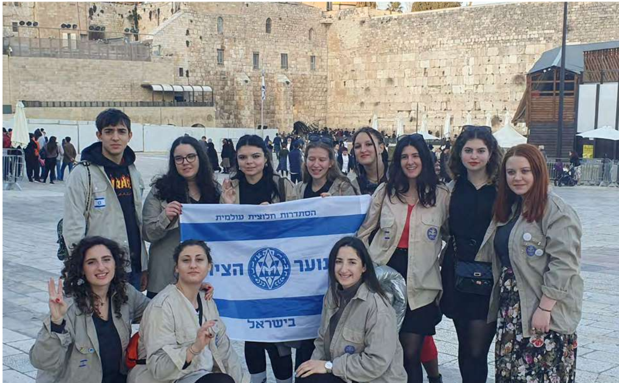
ISM (Intensive Seminar for Madrichim/ot), Tzevet of Hungary in Israel 2023.