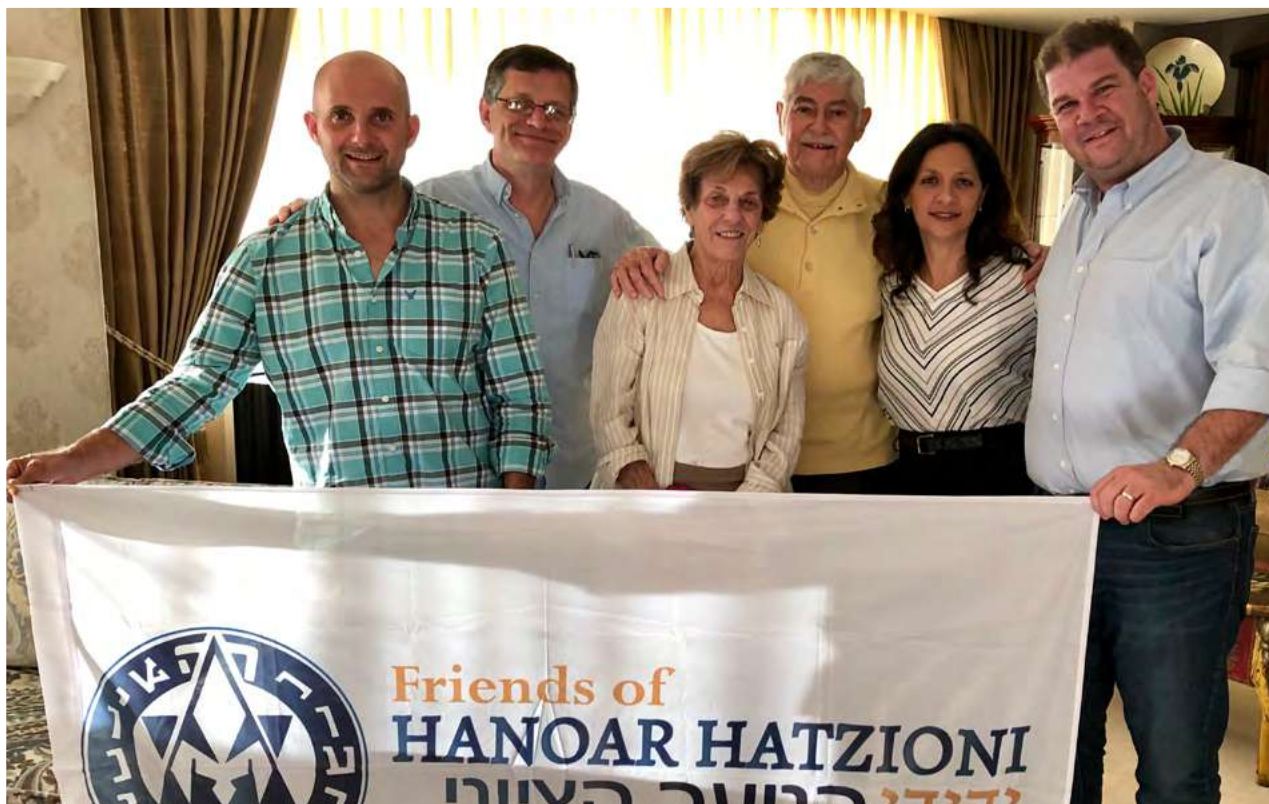
Board of Directors meeting of Friends of Hanoar Hatzioni- Geffen's Family House, Houston