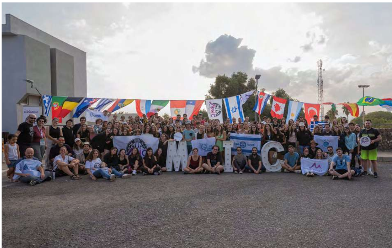
MIC 2 (Manhigut International Camp), 2022.