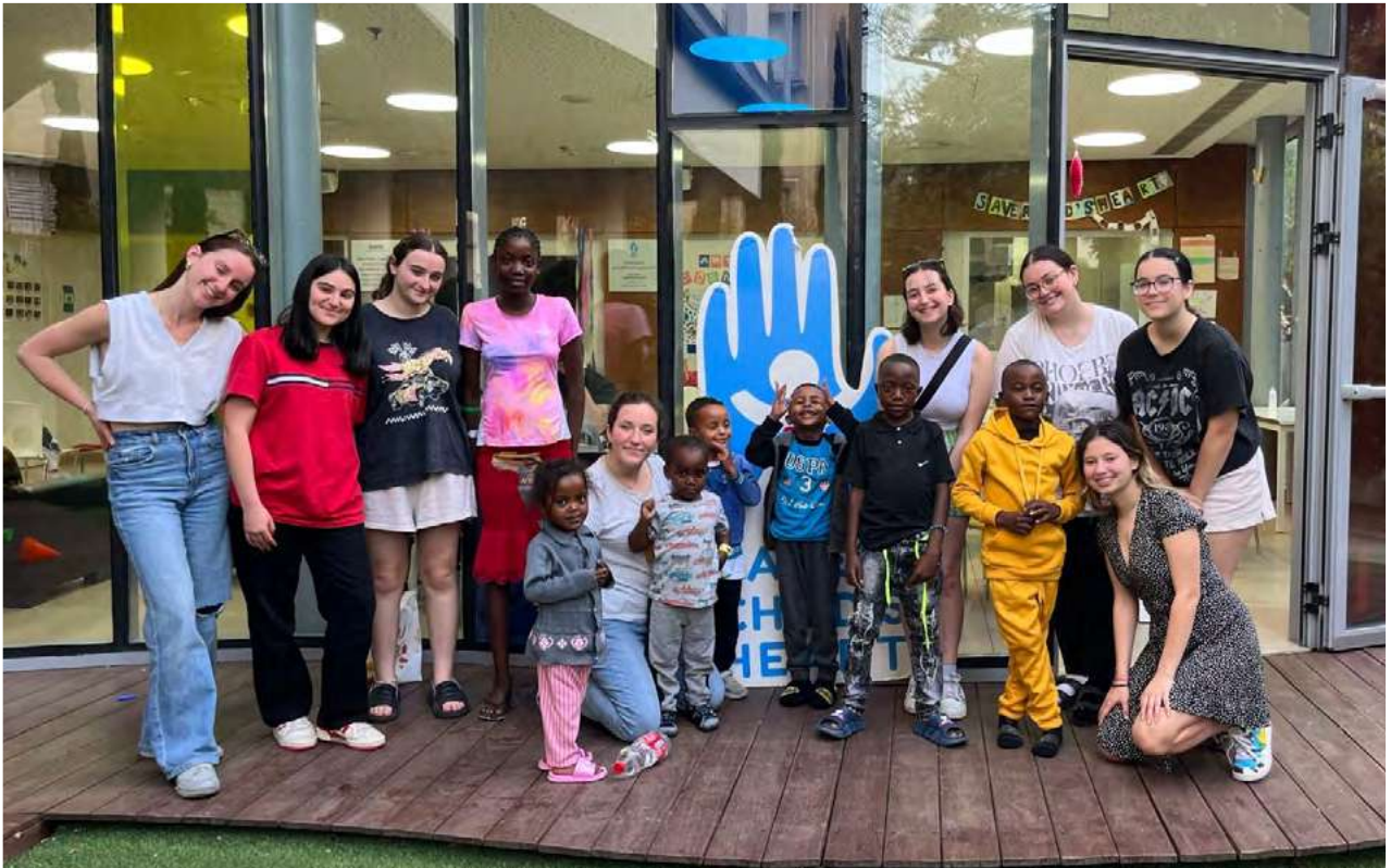
Arevim Masa Year of Service 2022-2023 at "Save a Child's Heart" association.