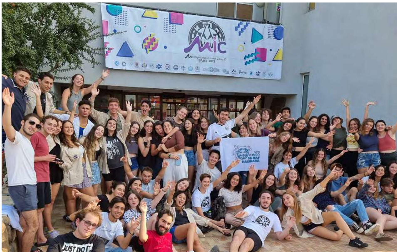
Shnat Hachshara Tzafon and Darom. MIC 2, 2022.