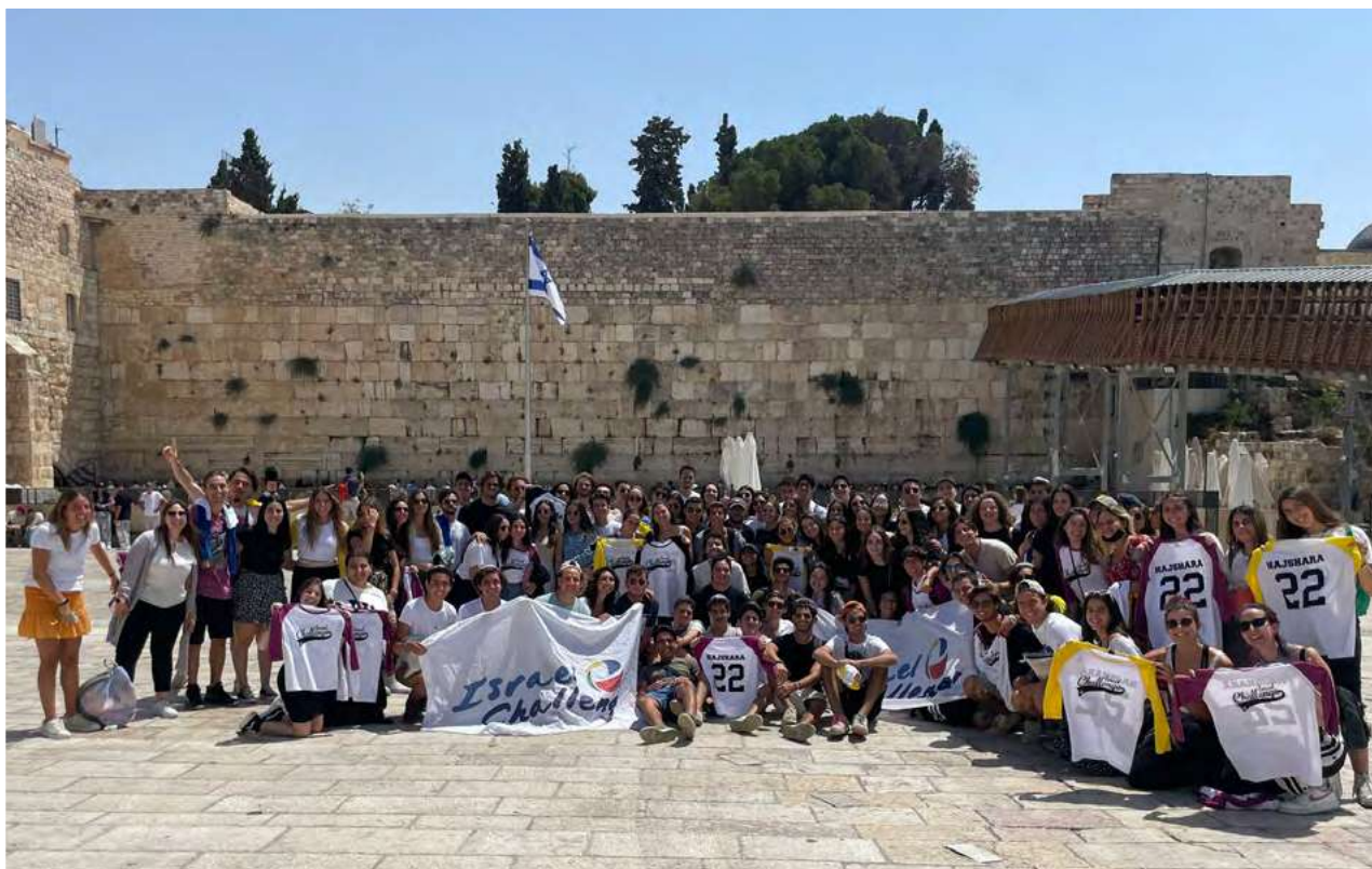
Israel Challenge, 2022.