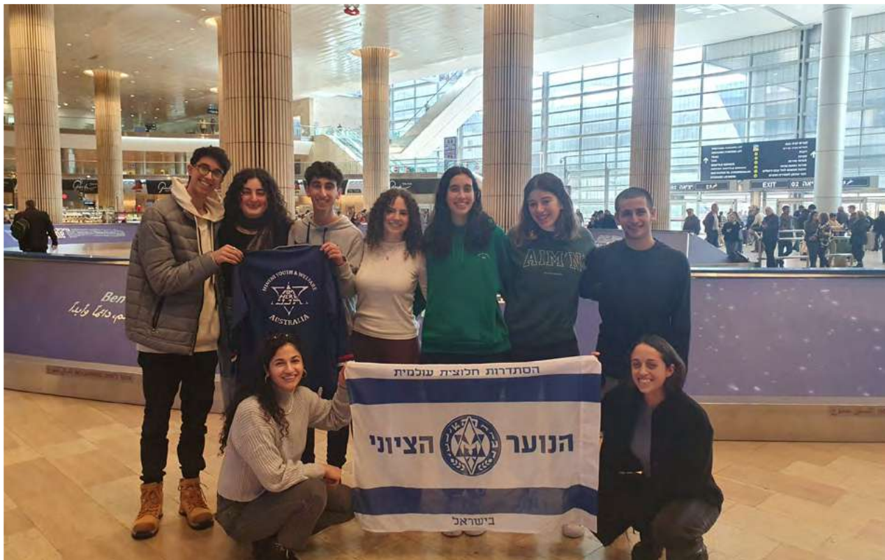
Shnat Hachshara Hineni, 2023.