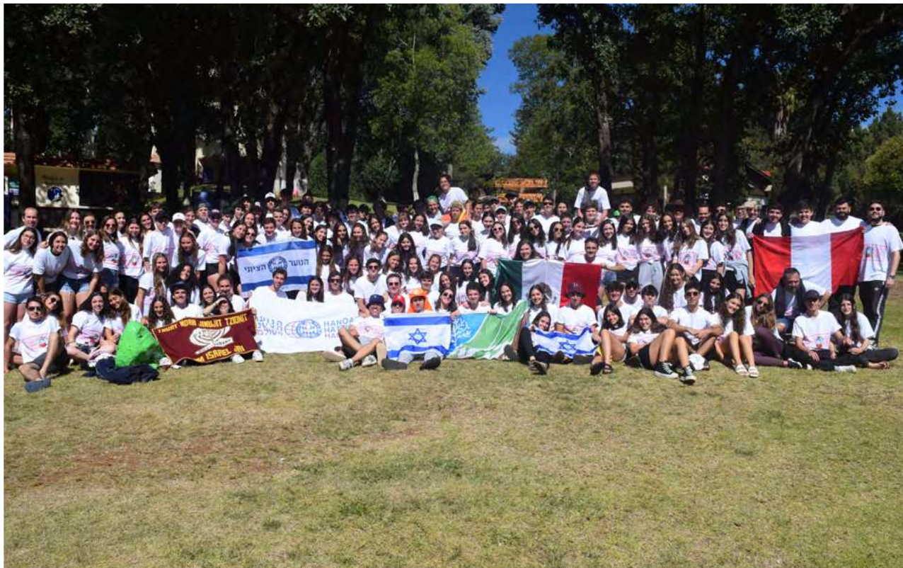
68 MCT, Mexico, 2023.