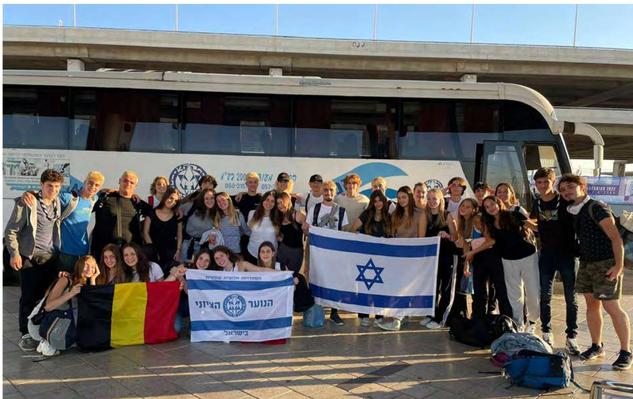
Mahane Israel. Hanoar Hatzioni Belgium, 2022.