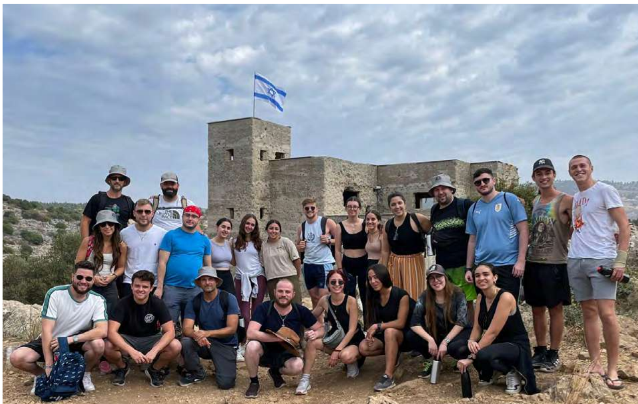
Bama Olim B'Israel and Manhigut at the MIC 2, 2022.