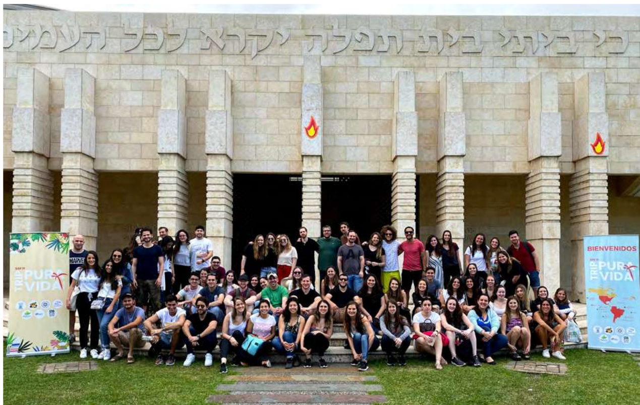
SIM III Trip Pura Vida. Costa Rica, 2019.