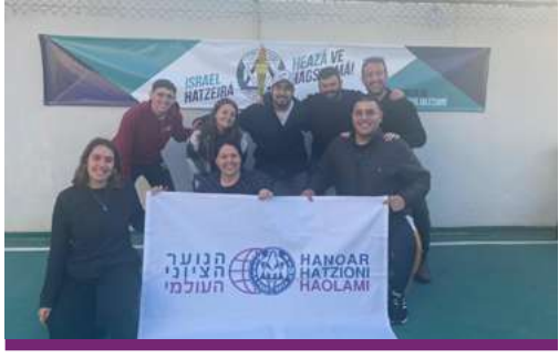
Pre-Machon Choref Argentina