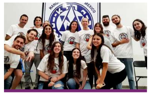
Pre-Machon Continental Tzfoni Mexico

Seminars of Manhigut, Peulot with tnuot, Fairs, Pre-Machon Continental Tzfoni, Pre-Machon Choref, meetings with parents and Community Leaders